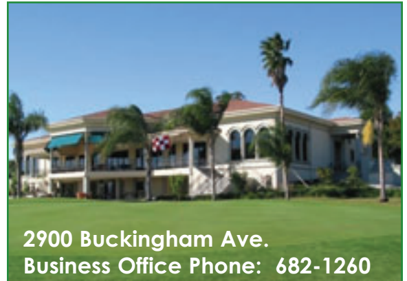
2900 Buckingham Ave. Business Office Phone: 682-1260