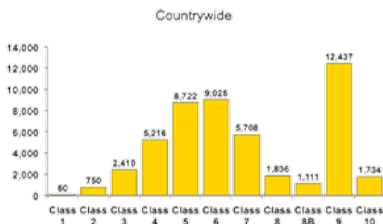
Above: 2013 Nationwide Distribution of Public Protection Classification Codes.

ISO auditors visited in July of 2013, during which Lakeland's Fire Department, Water Department, and Police Communications Center were evaluated to come up with the final determination. Of the 682 ISO rated communities in Florida, only 40 have a level 2 classification placing Lakeland in the top 7 th percentile. The LFD's score of 2 was very strong, only 2 percentage points below a score of 1. The score is anticipated to become effective March 1, 2014.