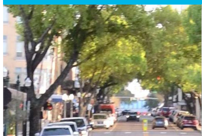
Roadways & Transit

Level of service standards are set in this chapter for public facilities including: