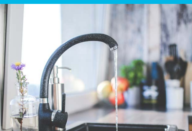
Water, Wastewater, and Solid Waste