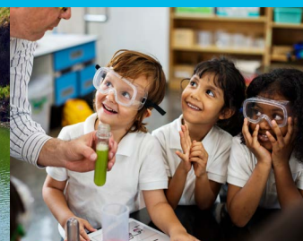
Public School Facilities