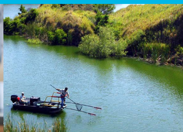
Recreation and Open Spaces