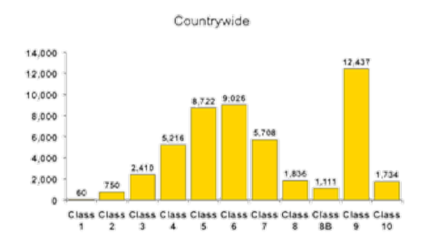
Above: 2013 Nationwide Distribution of Public Protection Classification Codes. Provided by ISO Properties.

ISO auditors visited in July of 2013, during which Lakeland's Fire Department, Water Department, and Police Communications Center were evaluated to come up with the final determination. Of the 682 ISO rated communities in Florida, only 40 have a level 2 classification placing Lakeland in the top 7<sup>th</sup> percentile. The LFD's score of 2 was very strong, only 2 percentage points below a score of 1. The score is anticipated to become effective March 1, 2014.