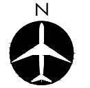
EXHIBIT A 2021 SUN N FUN USE AGREEMENT